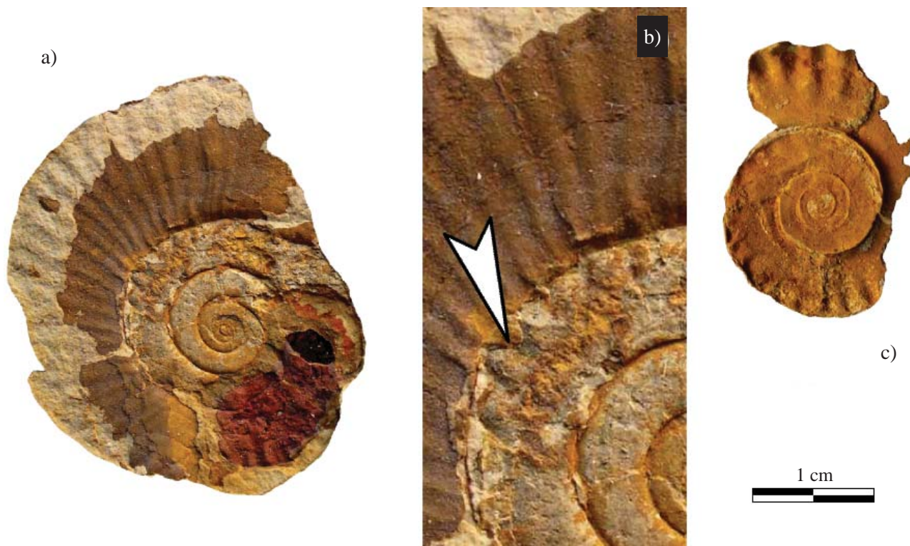
Figure 2. a-c: Ectocentriles hillebrandti n. sp. (a, b: IGM 6220, c: IGM 6217); a: holotype, b: detail of the inner whorls of the holotype. The arrow points to the strong ribs on the inner whorls representing the E. «leslei» ontogenetic stage; c: specimen showing the smooth initial and the strongly ribbed intermediate ontogenetic stages. The scale is for Figures a, c.

Remarks. The distinction between Gleviceras and Oxynoticeratidae based on crushed material is very ambiguous. Although the ranges of the two genera are well known in the Euroboreal domain (Dommergues et al. , 1994), their